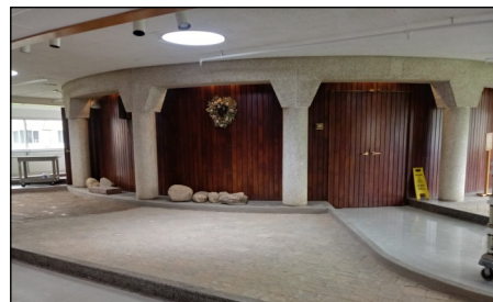
Our Chapel area is really shaping up!