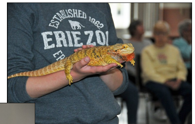
Erie Zoo Pet Therapy Visit: May 14, 2019 Bearded Dragon (right) Chinchilla (below)