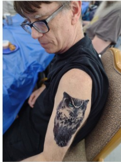
Your Social Services Team