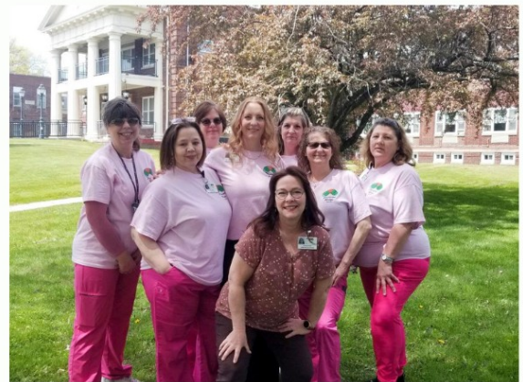
Your Recreation Team