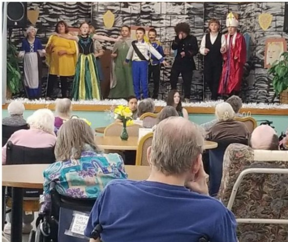
Springfield Elem "Frozen"