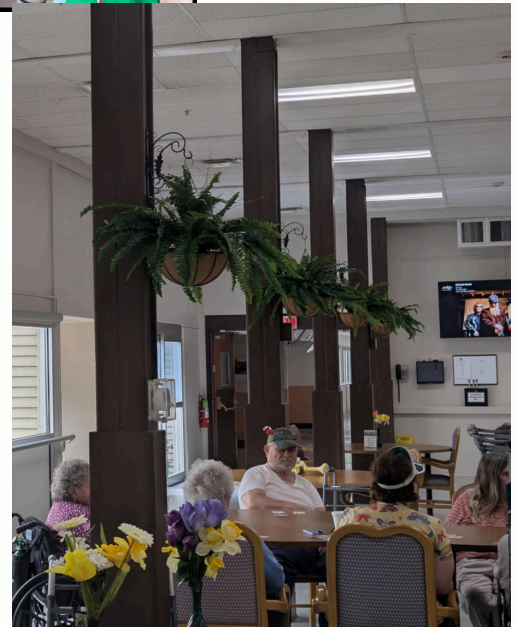
Dining room Refresh in progress!