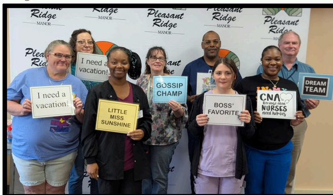
Nursing Assistants Week Celebrations