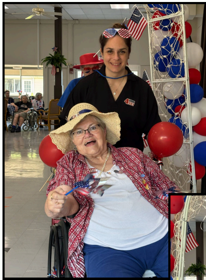
July 4 th Parade & Party